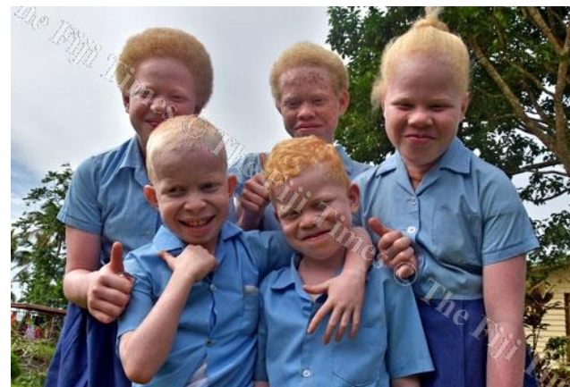
Albinism Students at the Fiji School for the Blind