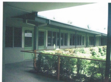
The 4 new classrooms