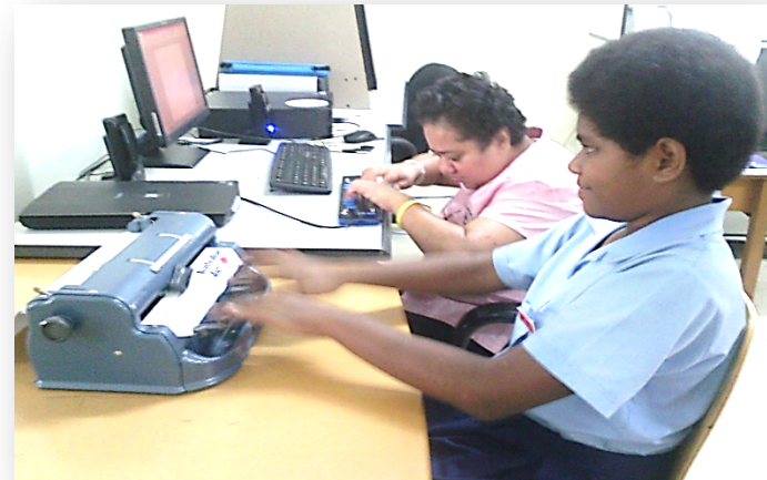
One of the student using the Braille Machine and the Brailist is using the Focus Blue 40