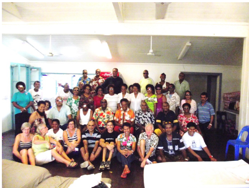
Surgeons from Hawaii, Taveuni Rotary Staff, Field officers of Fiji Society for the Blind and Patients during the Taveuni Eye Surgery Project