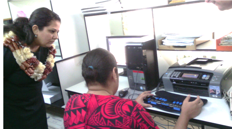
Focus Blue 40 donated by the Government of Australia through FCDP Funding for our Transcription department