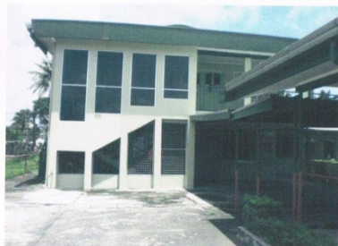
New Admin Block